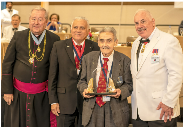
Council 13654 San Patricio

Council awards are based on individual council's applications for awards in membership, charitable giving and service