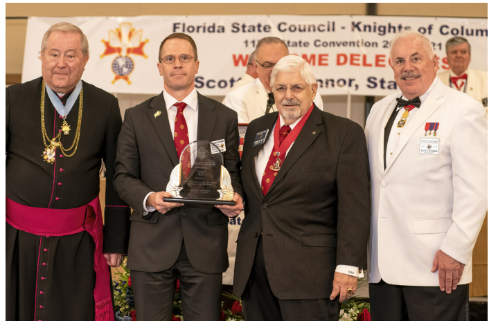
Council 16236 St. Thomas A Becket

The Knights of Columbus is a Catholic men's fraternal organization of nearly 2 million members worldwide. The principles of the Order are Charity, Unity, Fraternity and Patriotism. The Florida State Council is one of the largest jurisdictions of the Knights with more than 300 councils throughout the state.